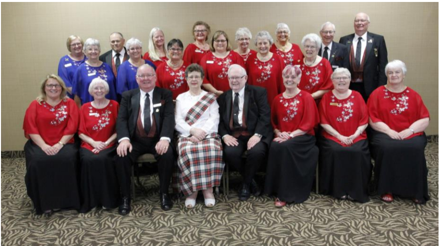
Grand Family 2019 - 2021